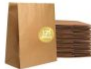
Clean brown paper grocery bags