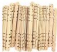
Natural Notched Building Sticks