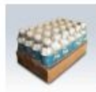
Case of drinking water