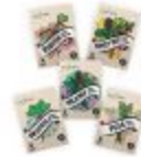
Variety of green bean and marigold seed packets